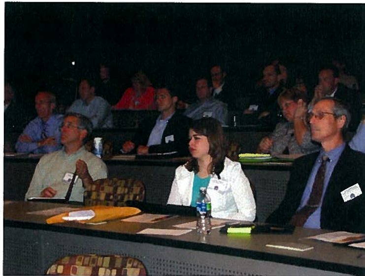
PA dialogue attendees listen to the day’s presentations.